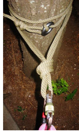
Trees and rock horns: no special rigging. Just push ring out of the way and tie like a cordelette.

If there's no limiting knot, it can achieve dynamic 33-33-16-16 load distribution.