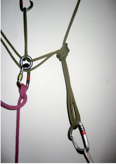
A simple way to connect a piece for upward pull.