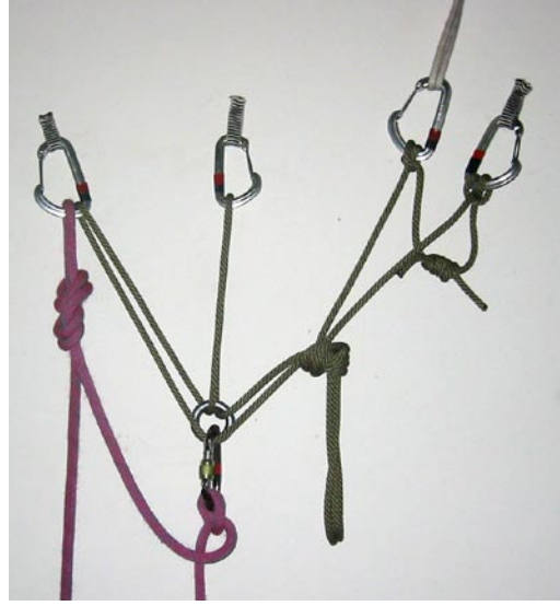
A way to connect four pieces. The two clove-hitched pieces share the load imperfectly (as in an equalette).

If there's no limiting knot, it can achieve dynamic 33-33-16-16 load distribution.